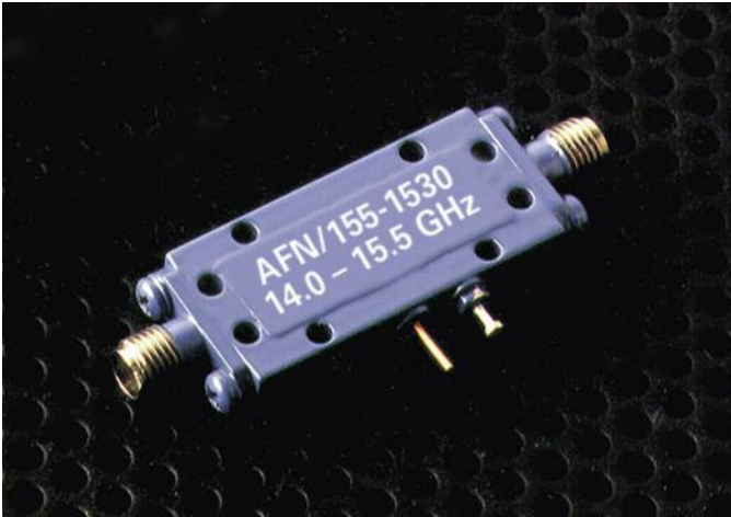
Figure 4. Model AFN/155-1530 Solid-State Low-Noise Amplifier