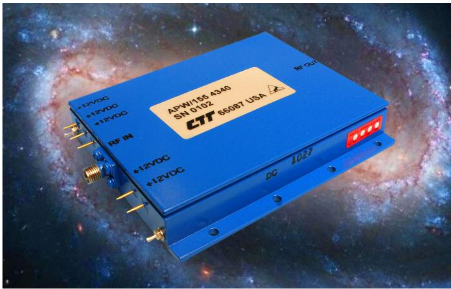
Figure 2. Model APW/155-4340 Solid-State Power Amplifier

Engineered specifically to meet the rugged environment of TCDL operations, CTT's model APW/155-4340 (Figure 2) is a solid-state power amplifier which provides 20 watts of power across the instantaneous bandwidth of 14.0-15.5 GHz (Figure 3) making it suitable for use on a variety of platforms, depending on configuration (i.e: duplex or transmit only). Additional specifications include 58 dB of small signal gain, 4.9 dB noise figure, and a compact size of 3.9 (L) in. x 3.5 (W) in. x 0.67 in. (H). Ideal as a companion amplifier of TCDL receivers is CTT's newest LNA design, the AFN/155-1530. Optimized for operation from 14.0 to 15.5 GHz, this amplifier allows front-end noise figures of <1.5 dB. Additionally, this new LNA provides gain of 30 dB min. in a drop-in package measuring only 1.6 in. (L) x 0.66 in. (W) x 0.22 in. (H) (Figure 4). Thus, when combined together, a complete RF front end solution is available for both airborne and ground terminals.