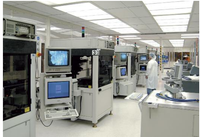
Figure 5. USA-based, fully automated, thin-film microwave production facility

The RF transceiver front end continues to be one of the most vital functions in providing real time connectivity and interoperability among an array of manned and unmanned intelligence, surveillance and reconnaissance (ISR) and electronic warfare (EW) systems.